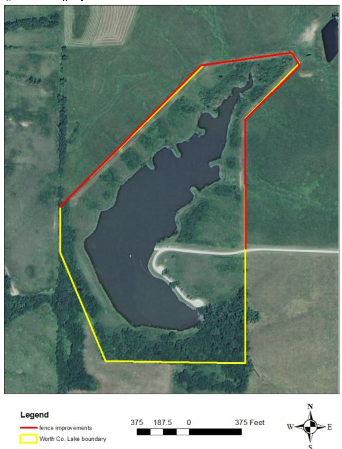
Figure 3: Fencing Improvements